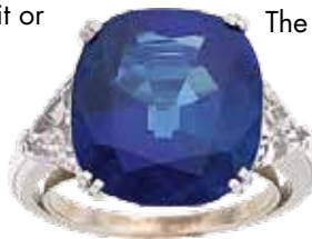
Kashmir Sapphire, Diamond, Platinum Ring Estimate: $250,000-$350,000 The Property of a Midwest Family Collection Fine Jewelry Auction, April 3, 2012 HA.com/5092*58428

Selling valuables and vintage collectibles through auction may be the most viable and timely method for reaching the widest audience and achieving the best possible sale prices. Knowing a definite sale date and expected sale estimates are strong arguments for trusting the auction process in selling valuables. To further demystify the auction process, Heritage's automated system updates consignors by email as their property advances on each step on its journey to being sold. One thing to remember when selling at auction – since the fees earned by the auction house are based on a percentage of the sale price of each lot your interests and those of the auction house are directly aligned.