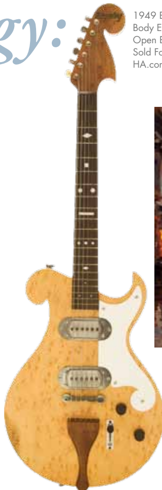
1949 Bigsby Birdseye Maple Solid Body Electric Guitar, #51649 Open Bid: $55,000 Sold For: $266,500 April 2012 HA.com/7061*54305

The "reserve" is the minimum price for which an item can possibly sell for at auction. The reserve price will be set by the seller in conjunction with the expert advice of the auction specialist at an amount below the low end of the auction estimate. While many auction houses do not divulge the reserve to bidders, Heritage Auctions discloses reserves prior to the auction and bidding begins at the reserve amount. By making the reserve known, bidders know that their accepted bid in the auction can always truly be the winning bid, versus having to wonder if their bid will meet the mystery reserve price. Items offered "without reserve" will always sell to the final highest bid. Most lots sold "without reserve" at Heritage auctions have the protective measure of a predetermined starting bid amount, usually half the low auction estimate, which also acts similar to a reserve as the lot will not sell if it does not receive that minimum starting bid.