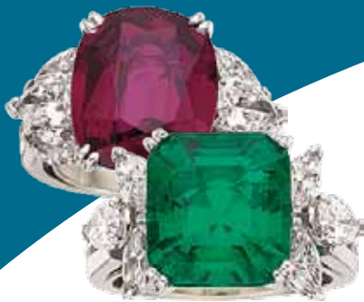
Ruby, Diamond, Platinum Ring Estimate: $150,000-$200,000 The Property of a Midwest Family Collection Fine Jewelry Auction, April 3, 2012 HA.com/5092*58426