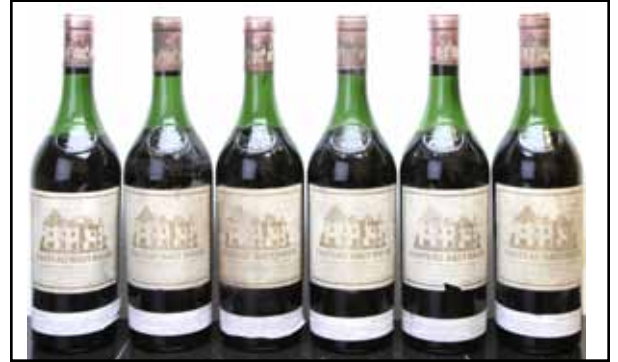
Chateau Haut Brion 1961 Sold For: $21,511 April 2012 HA.com/5106*415